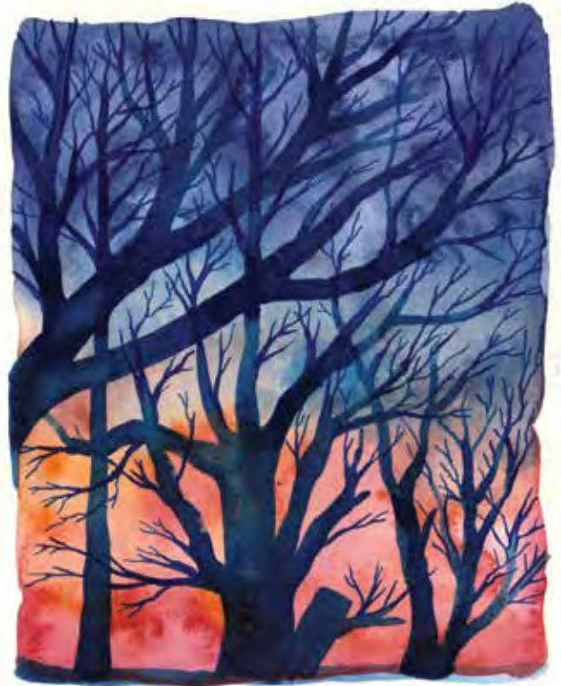
MAINE, 4:05 PM