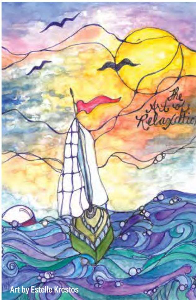
Art by Estelle Krestos