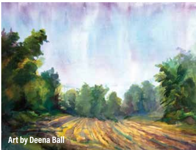
Art by Deena Ball

Special note: Many of our art classes require purchasing materials ahead of time to fully participate in the class. Supply lists are emailed to students after they register and before the first day of class.