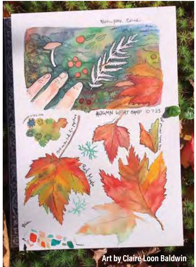
Art by Claire Loon Baldwin