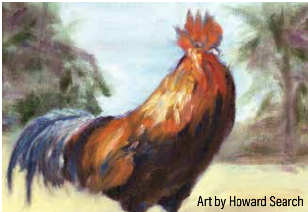
Art by Howard Search