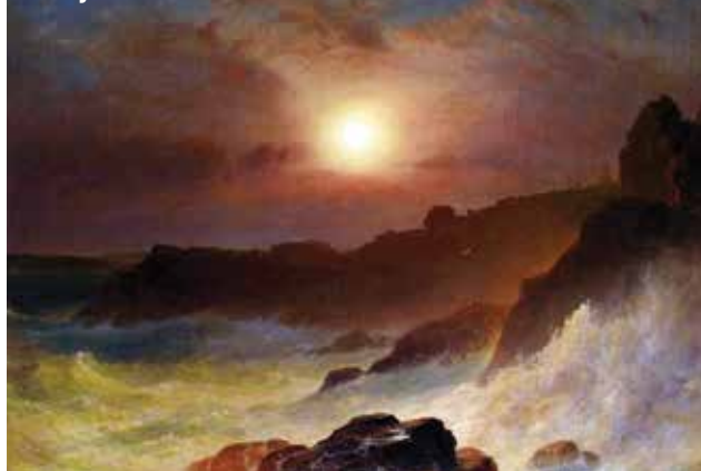
Art by Frederic Edwin Church